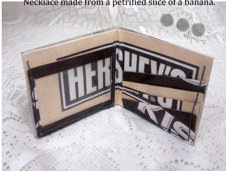
Wallet made from an old Hershey's carton.