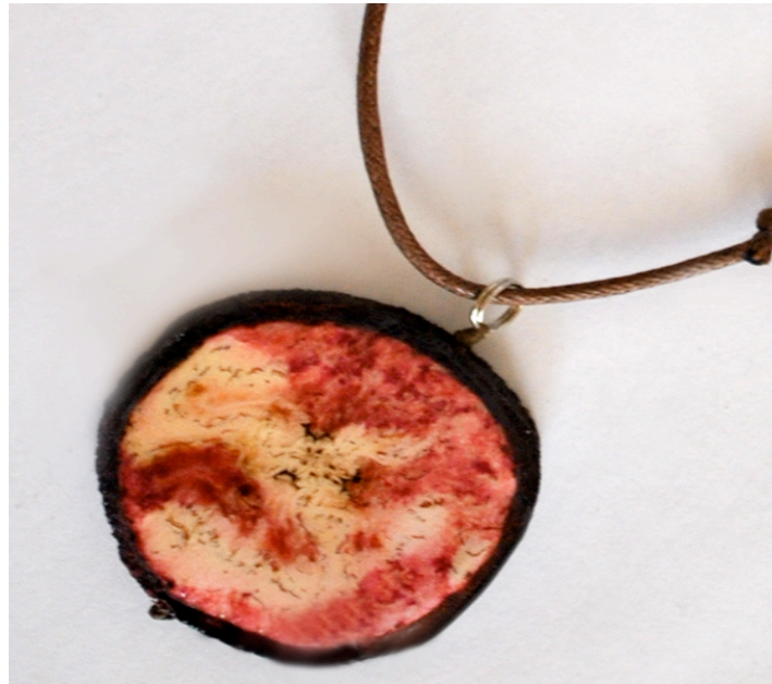
Necklace made from a petrified slice of a banana.

in the right direction as far as environmental preservation and conservation. Below are images depicting some of the products made locally and sold in the store. The last image is a bingo board used for children's educational games in the local workshop, the bingo boards were made from cardboard taken from garbage bins around town and the decorations are bottlecaps.