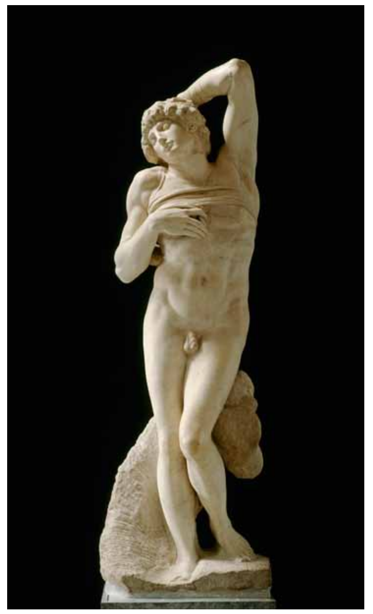
Michelangelo Buonarroti, The Dying Slave, ca. 1513-14.

In some instances, images were effective punishments in and of themselves. David Freedberg expands on "images of infamy," noting that their official use in Italy began in the late 1200s.6 Though such a method was generally reserved for cases when a corporeal execution was not possible (as in instances when the criminal fled), images of infamy had their place definitively in law codes of the period: "Item: It is decreed and ordained that anyone who does