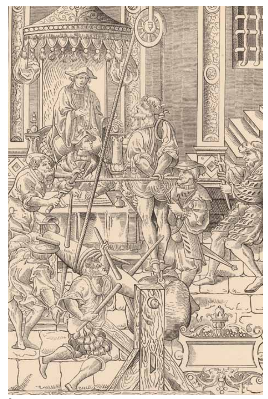
Figure 4 Jean Milles de Souvigny, The estrapade, or question extraordinary, 16th century.

As observers and documenters of the world around them, artists necessarily had to draw upon the resources at hand for models from which to craft accurate representations of the human form.