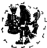
Figure in our logo is that of Huitzilopochtli, main god of the Aztecs, fol. 89R Codex Magilabechiano, mid 16 th C. Central Mexico