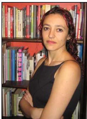
Professor Lina Meruane