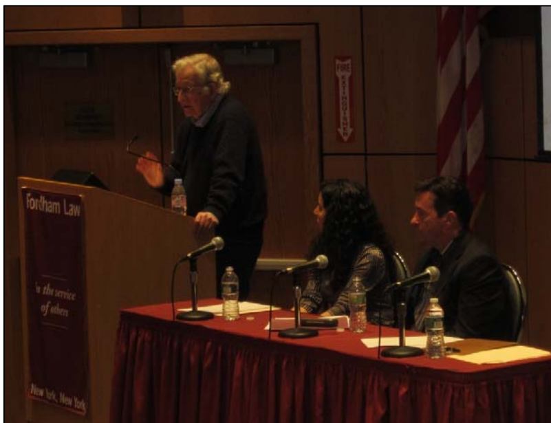
(Photo taken during the Voices from the Other Side Event, April 4 th 2012)

This event, held at the Law School's Mc Nally Amphitheatre, was very well attended by Fordham graduate and undergraduate students, faculty, administrators and general public of the NYC metropolitan area. Cuban-Americans from different associations throughout the city, as well as representatives from the Cuban Permanent Mission to the United Nations were also present. With this panel and discussion, LALSI's objective was to offer another tool for the NYC academic community and the general public to engage in a discussion of the many intricacies that define the sometimes-thorny Cuban-American relationship. We believe it was a most successful event that we were proud to host.