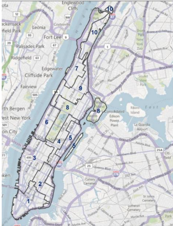
Figure 1: Map of Manhattan Council Districts